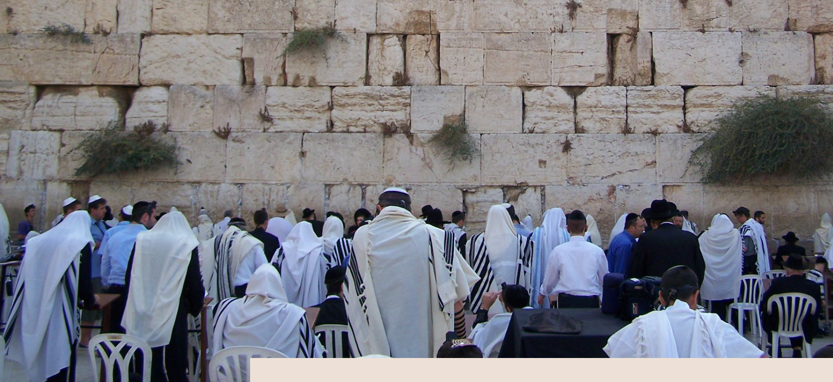
"Muro de las lamentaciones - Muro oeste" by Pedronchi is licensed under CC BY 2.0; photo was cropped.