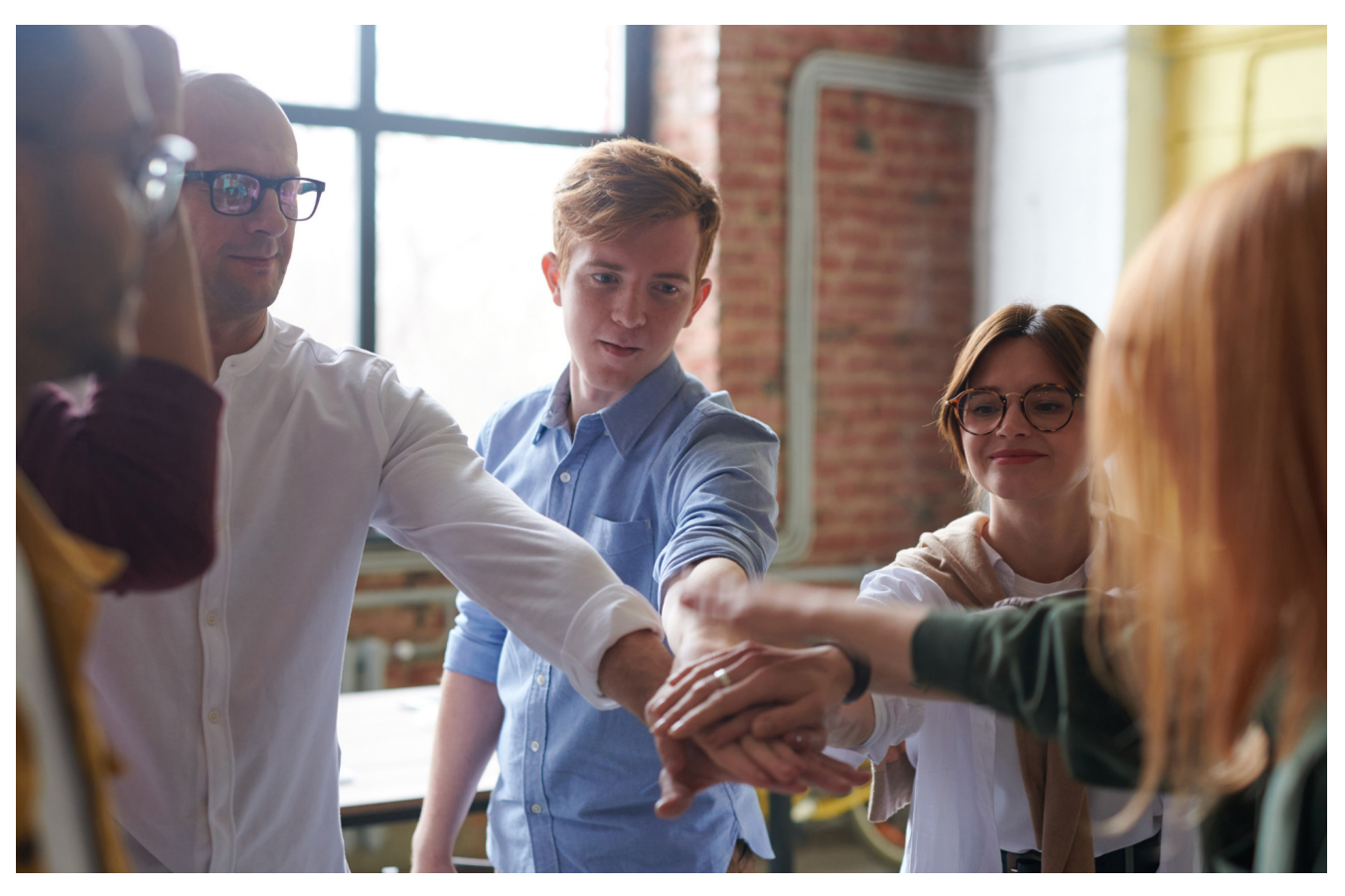
He Is a Personal God

I liken it to the story of the disciples seeing Yeshua walk on water across the Sea of Galilee. They were all amazed as they sat in their boat and watched this happen. But Peter decided to step out of the boat and walk with the Lord on the water. He was successful for a while until he looked at the strong winds and panicked. As he was sinking, he cried, "Lord, save me!" And Yeshua pulled him out of the water (Matthew 14:22-31). Peter experienced something different than the other disciples. The disciples in the boat observed God do something, but Peter had a salvation experience. The disciples believed that God did it, but Peter believed in the salvation that happened for him personally. Observing God do something or having a head knowledge about Yeshua from an educational or theological standpoint is far different than knowing personally that God saved you from death. I think sometimes we lose the idea that God wants to be a personal God. He is driven to be a personal God to you, and He is set to save you out of your troubles and problems beyond your initial salvation.