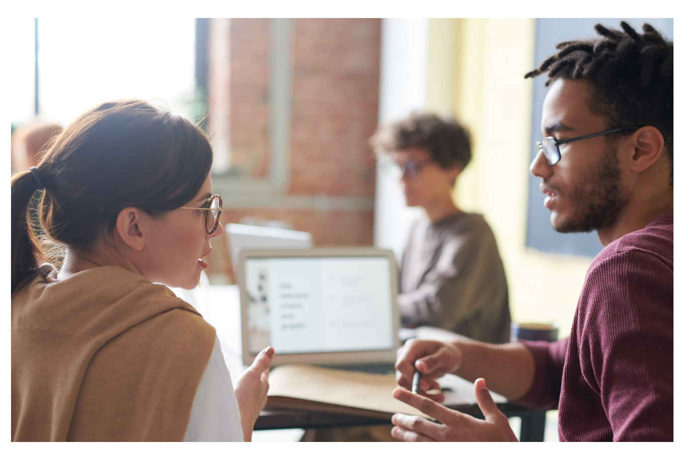
The Spirit Is Poured Out to Be a Witness

We love this idea of having power when the Holy Spirit comes. We like having the gifts of the Spirit. But what is our motivation for using these gifts? "Well, I want the word of knowledge and the word of wisdom so I can stand on the platform in church and read people like a book. I want people to see what great miracles I perform when I lay hands on someone." If you really want to move in miracles, it will not happen because you come to church and pray for people who are sick. It will happen because you allow the Holy Spirit in you to have His testimony. And I can almost guarantee that it will not be in a church setting. It will be when you are in a crowded place at work, and your boss is standing twenty feet from you, and the Holy Spirit gives you a word for a coworker. That is where you decide, "Do I quench the Holy Spirit or not?"