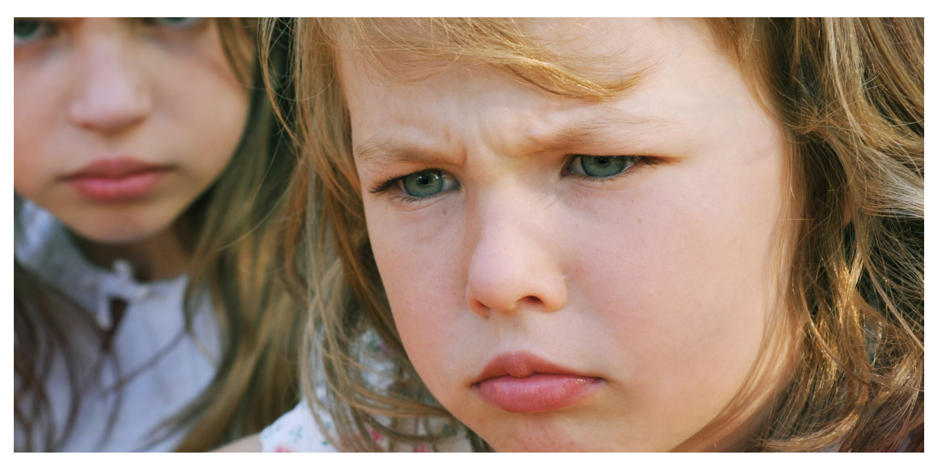
Obedience Is Easy. Relationship Is Hard.

There are many things that can be discerned. Some people are naturally more perceptive or psychic and can read things. The issue is what are you reading and by what means are you reading it? Our purpose is not to be reading the world though psychic or natural means, or worse yet, through the demonic realm. We must be moving in the Holy Spirit. We must have the mind of Christ, which is the mind of the Spirit (1 Corinthians 2:12-13, 16). Imagine how the psychic or natural man would have prophesied over Saul. He was persecuting the Church. He was stoning people to death. He was violent against the faith (Acts 8:1-3). Imagine the Church at that time moving on a natural level, reading his soul, the psychic reality of where Paul was positioned at that moment, and saying, "We need to judge this man." It would have been a disaster.