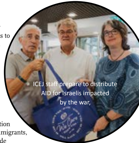
ICEJ staff prepare to distribute AID for Israelis impacted by the war,