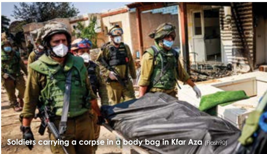
Soldiers carrying a corpse in a body bag in Kfar Aza

OVER 20,000 HAVE JOINED GLOBAL PRAYER GATHERING